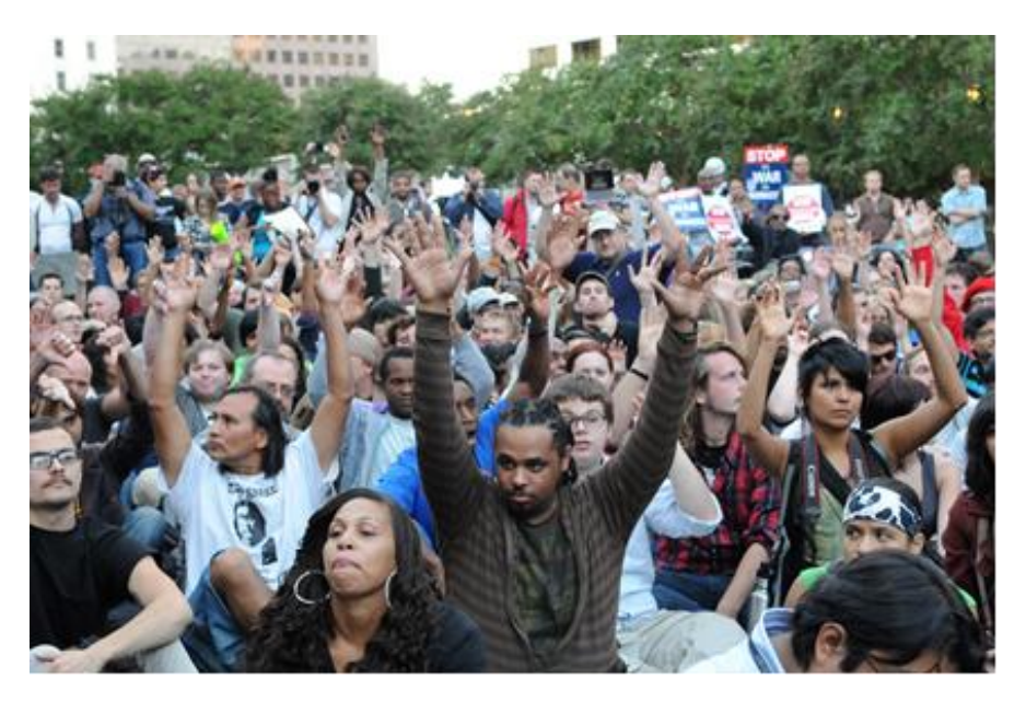
Photo: The movement spreads. The General Assembly from Occupy Atlanta